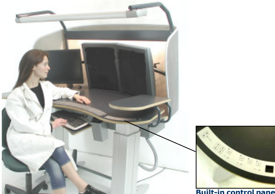
Built-in control panel